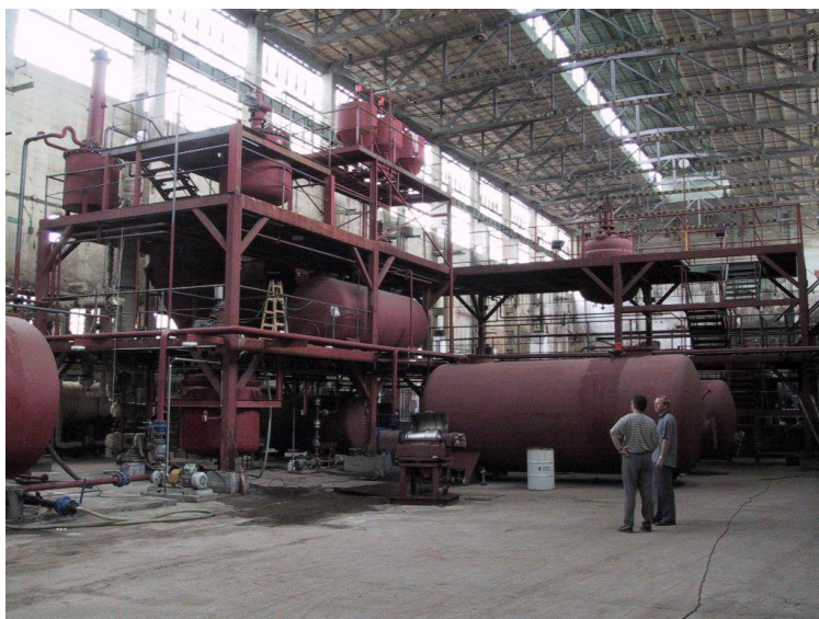
Biodiesel plant in Sered, Slovak Republic